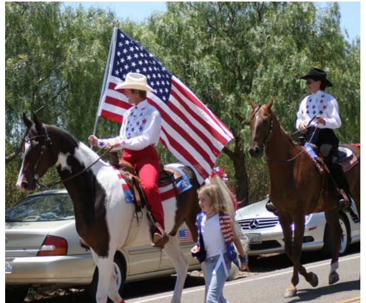
Ladies rode their horses in the parade.